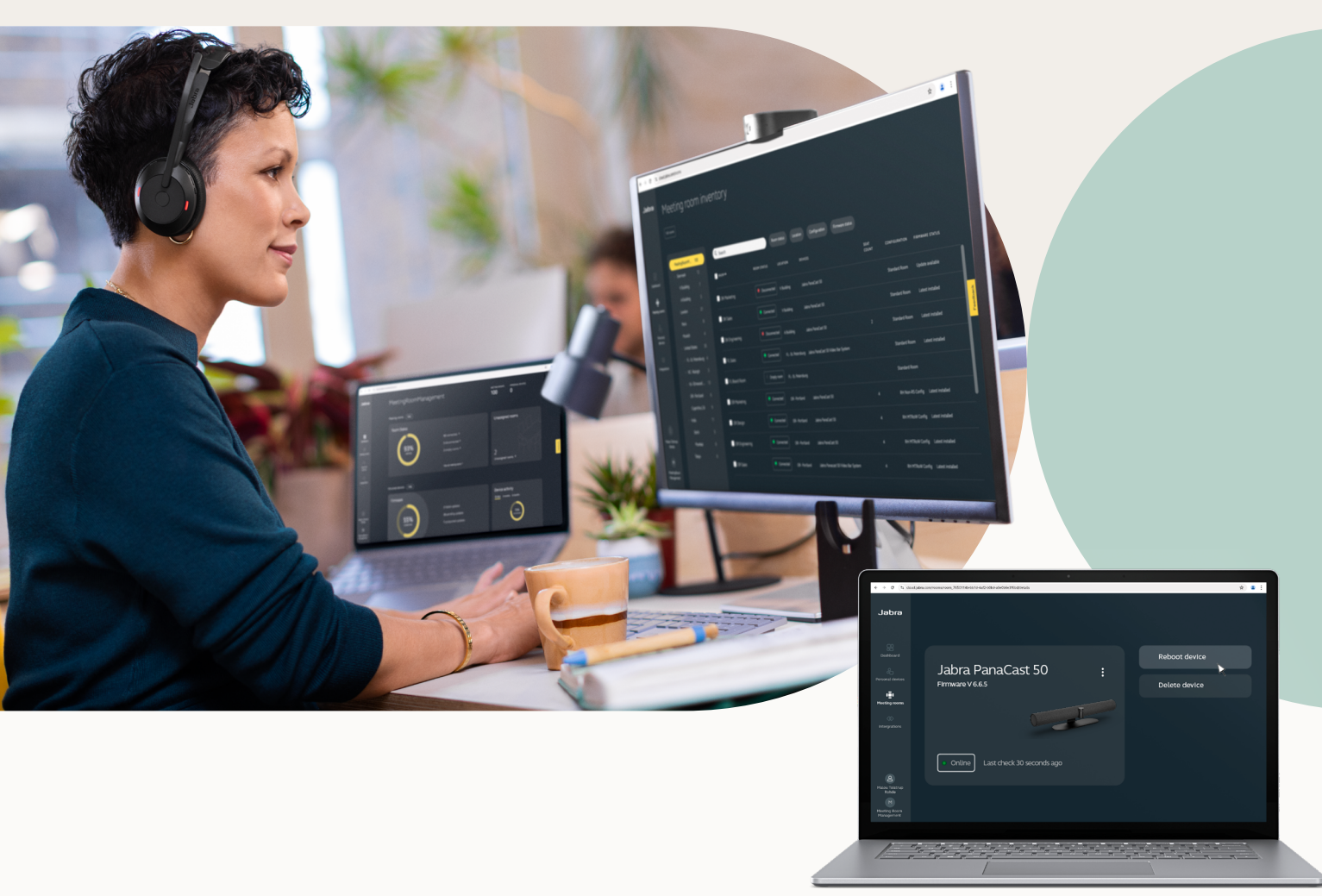
Remote reboot of device shown